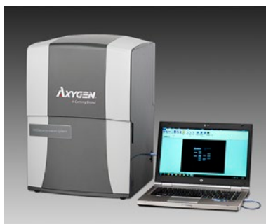
Axygen gel documentation system

Axygen® Gel Documentation systems easily capture publication quality, 16 bit TIFF images. The systems are quick to set up and have an intuitive user interface for image capture, annotation, and contrast adjustment. Images are easily saved and opened in common gel analysis software for more detailed analysis.