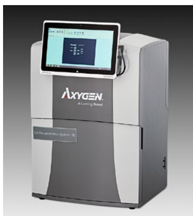
Axygen gel documentation system-BL